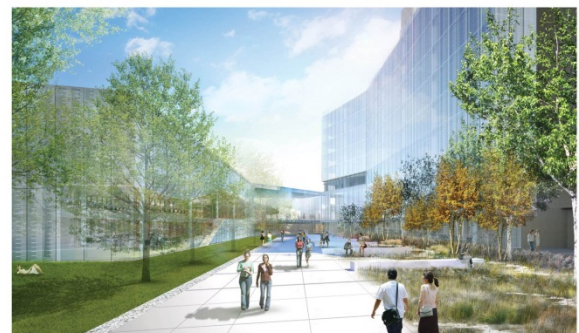
Exterior Elevation and Main Entrance – Looking East from Tower Road