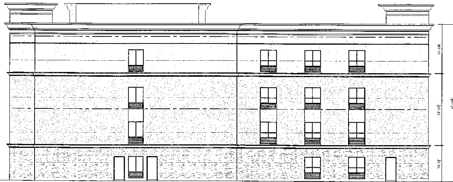
D1 SOUTH ELEVATION 1/8" = 1'-0"