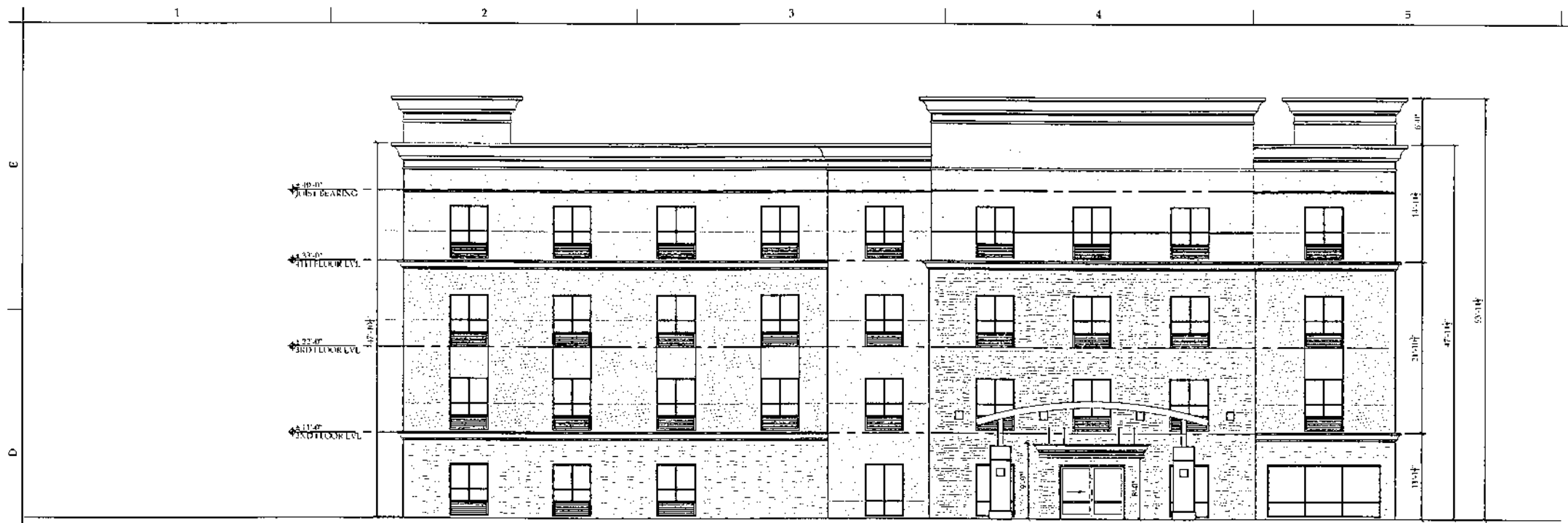
D1 NORTH ELEVATION 1/8" = 1'-0"