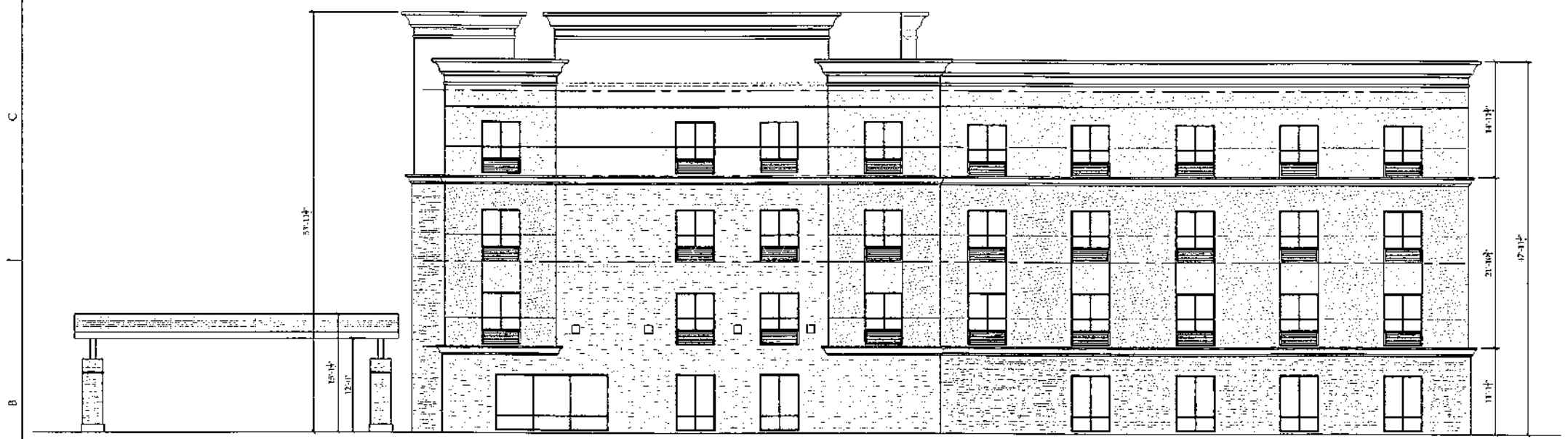
B1 WEST ELEVATION (ANDERSON RD) 1/8" = 1'-0"