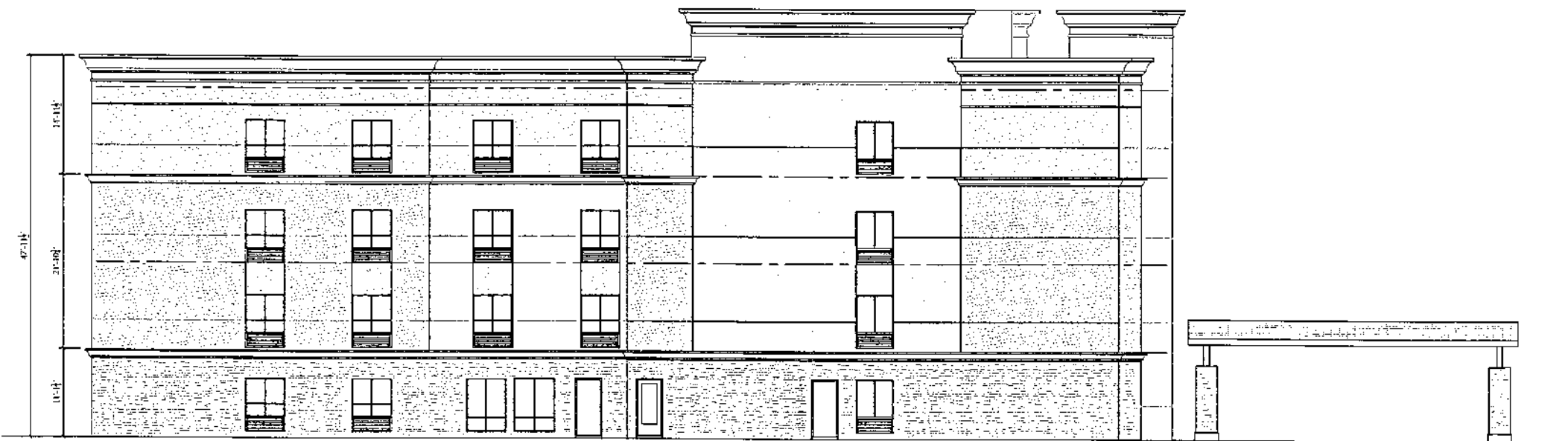
B1 EAST ELEVATION 1/8" = 1'-0"