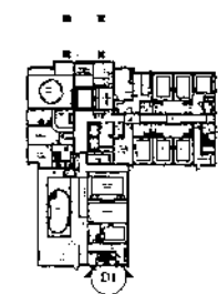
A6 KEY PLAN 1/8" = 1'-0"