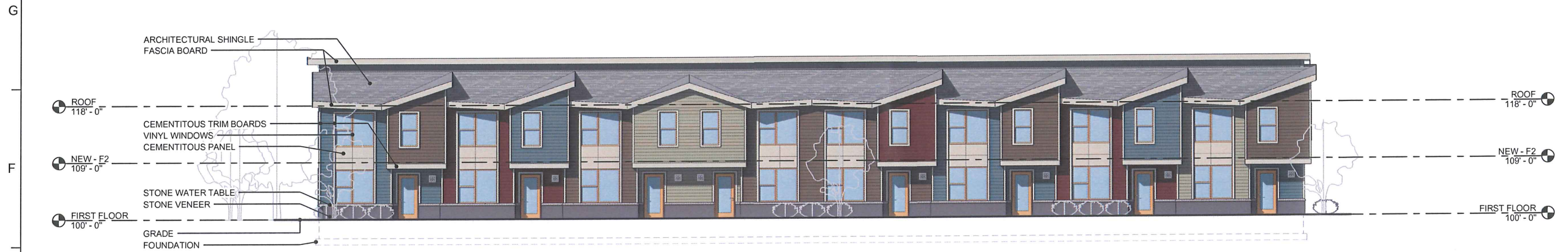
F3 COURTYARD ELEVATION 1/8" = 1'-0"