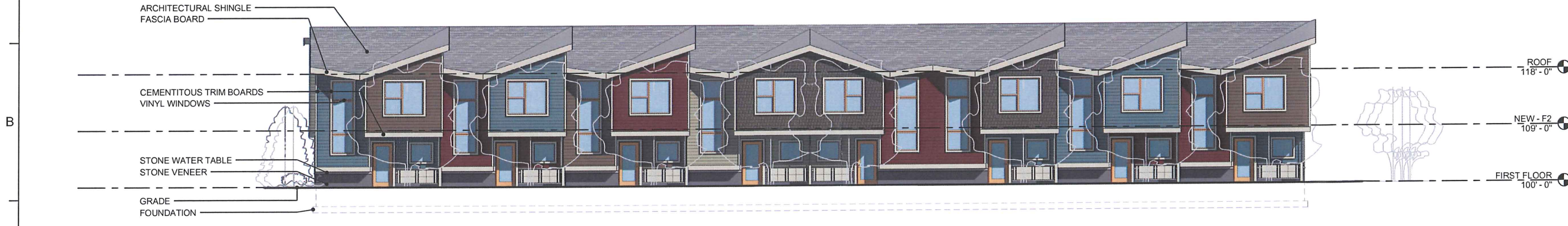
A3 SPENCER ROAD ELEVATION 1/8" = 1'-0"